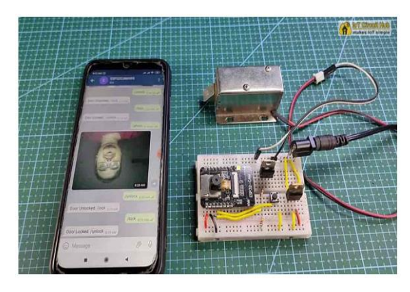
IV. HELPFUL HINTS

lock system over WIFI, providing convenience and enhanced security to users.