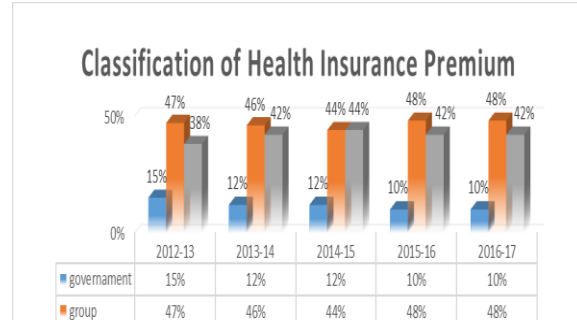
Chart No: 6.2