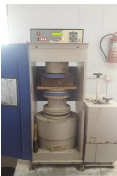
Fig 3. Experimental Setup

The prepared specimens were tested for compressive strength and water absorption and the results were discussed in the next chapter.