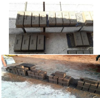
Fig 2. Casting & Curing