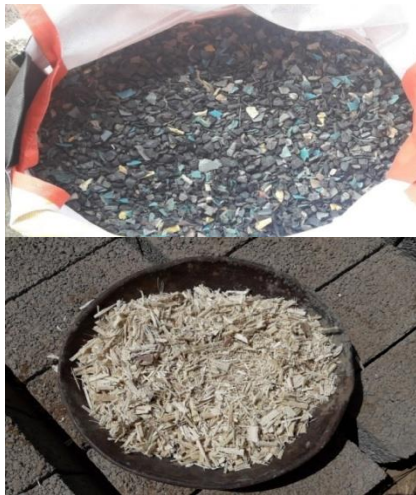
Fig1. E-waste and Sugarcane Bagasse

Five different mix proportions were determined in which the cement, fly ash and quarry dust content, electronic waste and sugarcane bagasse percentage are varied. The compositions of different materials in each mix were tabulated below.