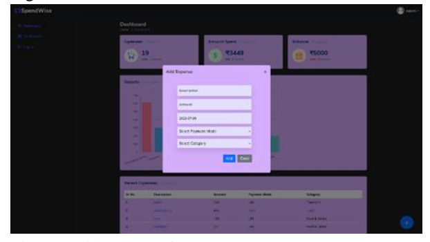
Fig. 3. Add expense form.