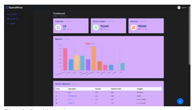
Fig. 2. Dashboard.