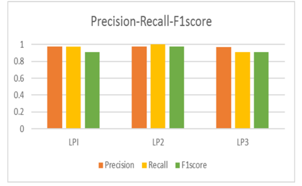
Fig.2. Performance measure of proposed system.