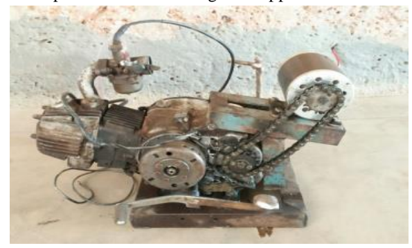
Fig. 6: Fabricated Model

Fabrication includes the procurement, modification and assembling of components in a proper way according to the planned design. Using trial and error method the motor is fixed in such a way that there is no power loss. The switch is placed between ignition and the motor so that automatic cutoff of ignition takes place when the third gear is applied.