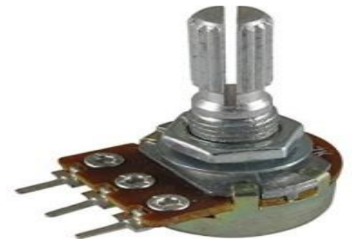
Fig. 4: Potentiometer

Potentiometer: This device is used to control the speed of the DC Motor. This is three terminal resistors with a sliding or rotating contacts that for an adjustable voltage divider. If only two terminals are used, one end and the wiper, it acts as a variable resistor or rheostat. A potentiometer of resistance 4.7K-ohms is used