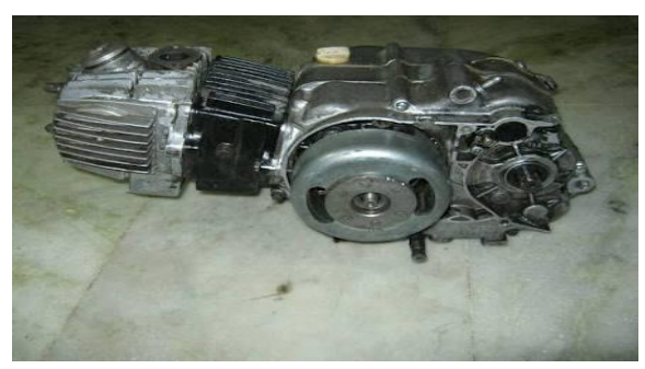
Fig. 5: Engine

Engine: An Engine with displacement of 100cc which will be able to produce 7.3 PS power which will be able to provide the initial torque for the system.