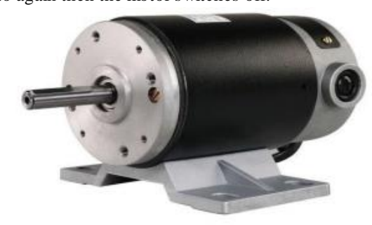
Fig. 3: PMDC Motor

PMDC Motor : A 500 watt PMDC motor 24V is used in this system. As soon as the third gear is shifted the motor switches on and when the first gear is shifted to again then the motor switches off.