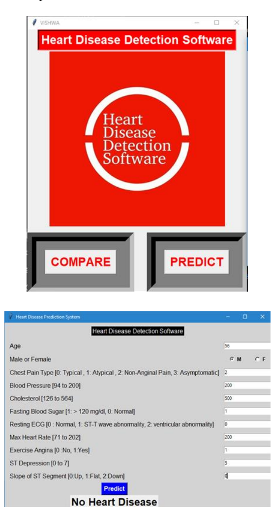
Figure 2: The Predicted Output as "No Heart Disease "For Input

To evaluate the efficacy of our developed model, we examined 20 inputs spanning diverse parameter ranges and compared the results against the ground truth. The model's predictions are summarized in Table 1.