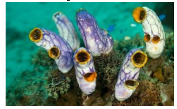
Figure 1 Ascidians

Ascidians (tunicates) are invertebrate chordates, and prolific producers of a wide variety of biologically active secondary metabolites from cyclic peptides to aromatic alkaloids. Several of these compounds have properties which make them candidates for potential new drugs to treat diseases such as cancer [Watters D. J. 2018].