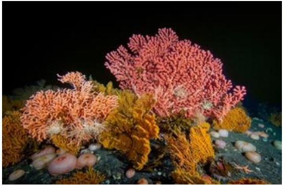
Figure 3 Alcyonacea

disease, viruses, and other diseases [oceanservice.noaa.gov].