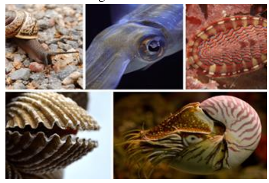
Figure 4 Mollusca

Mollusca are the second-largest phylum of invertebrate animals after the Arthropoda. The members are known as molluscs or mollusks. The operculum from Muricidae were used for curing a range of illnesses, such as swollen spleen, depression, rheumatism or arthritis, stomach ulcers, skin diseases including boils, warts and tumors, teeth problems, eye disease, hearing loss, epilepsy and paralysis [Benkendorff K.. et al. 2015].