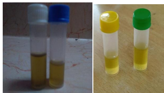
Oil sample of hexane solvent Oil sample of acetone solvent