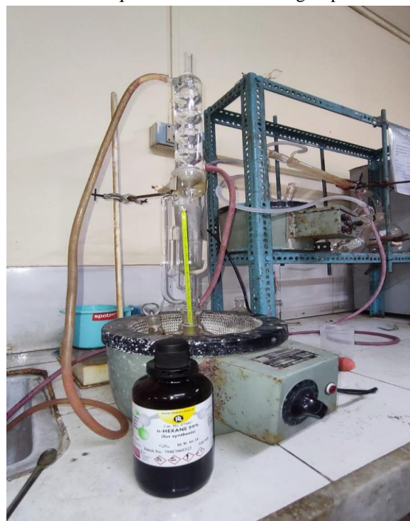
Experimental setup for extraction of oil