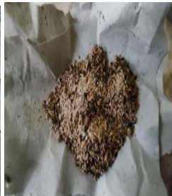
Custard apple seeds Custard apple seed powder