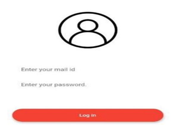
Fig.3 user login K Parking Available Locations Mall of Travancore Trivandrum View 20