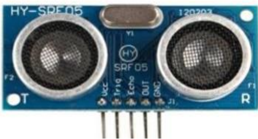
Fig 2. Shows ultrasonic ranging sensor

Fig shows the ultrasonic sensor. This sensor is being placed in the fixed pole part of garbage bin, so as to Intimate about the garbage level of the fixed garbage part.