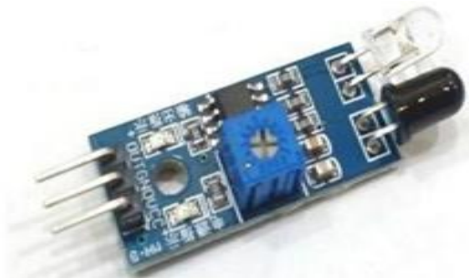
Fig 3. Shows infrared sensor

sensor here used is to control the path of garbage collector robot. It is also used to encounter the extent of the muck in the garbage car. Fig shows the diagram of infrared sensor.