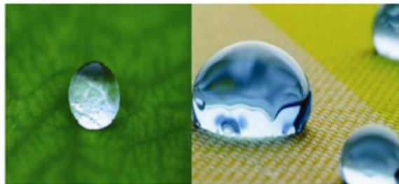
Figure 5. Lotus effect on the surface of a lotus leaf (left) and hydrophobic surface (right).

surfaces show a reduced soiling behaviour, because the particles have only low mechanical hold and can be removed either by air or liquid. When overlapping structures with dimensions of a few micrometres and superposed structure of 50–100 nm are