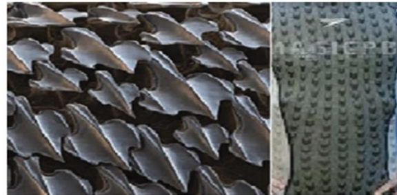
Figure 3. (Left) SEM of shark skin and (Right) Fastskin Fsii (FS2) swimsuit, mimicking shark skin.

hazard. Coating surfaces with Sharklet is seen to greatly reduce the growth of bacterial colonies, due solely to the nanoscale structure of the product. The topography of Sharklet, having 'ridge' and 'ravine' like qualities creates mechanical stress on the settling bacterium, a phenomenon known as mechanotransduction. The theory is that nanoforce gradients caused by variations in topographical features will induce stress gradients within the lateral plane of the membrane (plasma membrane) of a settling cell or microorganism during initial contact 39 .