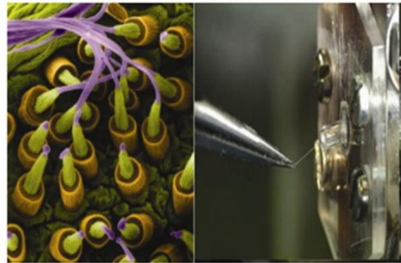
Figure 1. (Left) An electron microscope image of finger-like spinnerets of a spider. (Right) Biomimetic rig developed by Spinox.

material near one of its ends, then with a vibratory motion it pokes the end of the strip into the bulk of the nest. Once the strip sticks in the nest, it releases its grip, moves its head to the other side of the nest mass and grabs the end of the strip again and performs a similar action from the opposite direction of the nest. In this way it stitches its nest using its beak. The woven design of the entrance tube consists of interlacement of two sets of yarns at 45° angle, which provides the best resistance to the shear stress generated when the bird hangs from one side of the entrance at the bottom of the tube during nest-building. Weaverbird uses stitching, knotting and weaving actions during the building of its nest. In this way, its actions are similar to the weaving and knotting process adopted by human 32,33 . Thus observing the similarity in the weaving of present day plain fabric, it can be inferred that the concepts may have developed by mimicking the construction mechanism adopted by the weaverbird.