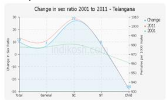
Change in sex ratio from 2001 to 2011 - Telangana.

to the 2011 Census. One individual characteristic is that the sex ratio in the districts of Nizamabad, Adilabad, Karimnagar, and Khammam is over 1,000. The sex ratio has been witnessing a growth in the State from 967 in 1991 to 971 in 2001 and further to 988 in 2011. Despite a favourable sex ratio of the total population, the sex ratio of children in the age group of 0-6 years is declined from 957 in 2001 to 932 in 2011. The sex ratio of the SC population at 1,008 in 2011 is much higher than the state average of 988 in all districts, except Rangareddy, Hyderabad, and Mahabubnagar districts. The sex ratio of the ST population at 977 is marginally lower than the state average of 988, but it is higher in Adilabad, Karimnagar, Nizamabad, and Khammam districts.