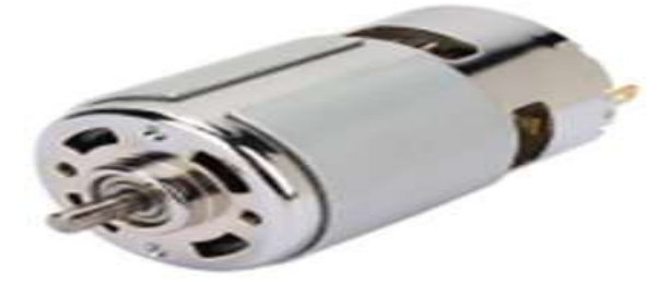
Fig. 5. DC Motor

The DC Motors provides reliable speed control environment. When the Bluetooth based device like mobile phone is connected to the microcontroller which sends data to the Bluetooth in the microcontroller to run the motor by controlling the speed and direction of motor with pulse width modulation signals.