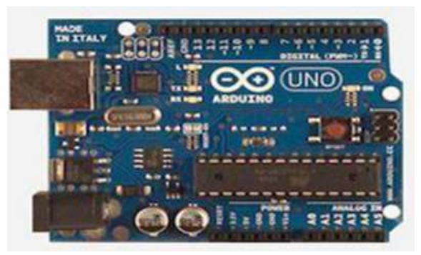
Fig -3: Arduino Board

between seven and twenty volts. it's additionally like the Arduino Nano and carver. The hardware reference style is distributed underneath Common artistic Attribution Share-Alike a pair of.5 license and is out there on the arduino web site. Layout and production files for a few versions of the hardware also are on the market. "UNO" means that one in Italian and was chosen to mark the discharge of Arduino computer code (IDE) one.0.The UNO board and version one.0 of arduino computer code (IDE) were the reference versions of arduino, currently evolved to newer releases. The UNO board is that the 1st in an exceedingly series of USB arduino boards, and therefore the reference model for the arduino platform. The ATmega328P on the arduino UNO comes preprogrammed with a boot loader that enables uploading new code thereto while not the employment of AN external hardware computer user. It communicates exploitation the initial STK500 protocol. The UNO additionally differs from all preceding boards in this it doesn't use the FTDI USBtoserial driver chip. Instead, it uses the Atmega16U (Atmega8U2 up to version R2) programmed as a USB-to-serial device.