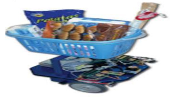
Figure 1: Product following shopping cart assistance robot

Through searching in mall offer the advantage of the saving time to peoples, they need solely weekend to go to store. This makes a haul at the money counter due to increasing range of consumers. The client needs to sub the request counter. Within the mall all and sundry take product place in to the self-propelled vehicle. once the searching is completed that person have to be compelled to sub the queue for request. once this method the sell person scan barcode of the every and each product and provides its final bill. This method is incredibly time overwhelming and it became worst of vacation special offers or weekends. To avoid this downside we have a tendency to introducing a completely automatic microcontroller primarily based self-propelled vehicle. during this self-propelled vehicle the client needs to choose the product within the display screen which list square measure transmitted to the self-propelled vehicle employing a sensible phone. The self-propelled vehicle is line following and therefore the corresponding distance square measure coated the self-propelled vehicle is stopped which item is choose and place to the self-propelled vehicle victimisation robotic arm. The robotic arm is connected to the self-propelled vehicle. The selfpropelled vehicle collects all things and move to the request counter.