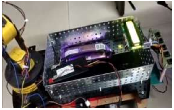
Fig 9: Product Pick and Placed