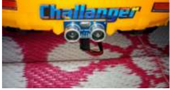
Fig 6: Ultrasonic Sensor C. Motor Driver (L293D)

The working principle of the ultrasonic sensor is that it uses high intensity of sound waves and the sound waves are returned as the echo to the sensor, with the help of this concept the distance are measured. Here in this project ultrasonic sensor are used to measure the distance between the two vehicles when they come nearer to some extent. As the two vehicles come across in the contact the data is transferred to the other vehicle about the current status of the vehicle so that the chance of accident reduces. The below figure 6 is shown how the ultrasonic sensor is placed on the vehicle.