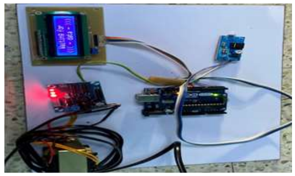
Fig 12: Experimental Setup of Receiver Side

In case of emergency situation or any break failure the buzzer sound is produced. These information are transmitted to the Li-Fi transmitter. Receives the information from the controller and it modulates the data to light signal and transmits to the receiver section. The transmitter part modulates the input signal with the required time period and transmits the data in the form of 1"s and 0"s using a LED bulb. These 1"s and 0"s are nothing but the flashes of the bulb. In the receiver section, it receives the modulated information from the transmitter section and demodulates the signal in order to recover the original data. . The receiver part catches these flashes using a photodiode and amplifies the signal and transmits to the controller so that the speed of the following vehicle can be reduced which will be indicated in the LCD display present in the receiver section.