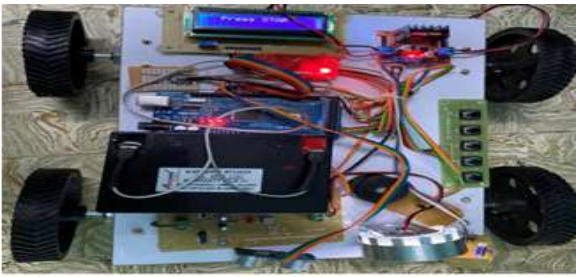
Fig 11. Experimental Setup for Transmitter side

The top view of the front vehicle and back vehicle is presented. The top view presents the various sensors interfaced with the control unit. The Top view of the front vehicle consists of a buzzer and a LCD monitor to notify the driver with a warning message. The Photo detector is used in front vehicle to receive the data transmitted by the LED. The Back vehicle consists of Ultrasonic sensor to measure the distance between the two vehicles. An Eye-Blink sensor is used to check if the driver is sleeping while driving and alcohol sensor is interfaced with control unit to find if the driver is intoxicated by alcohol and use the LED to transmit the safety related message so that the front vehicle can be notified.