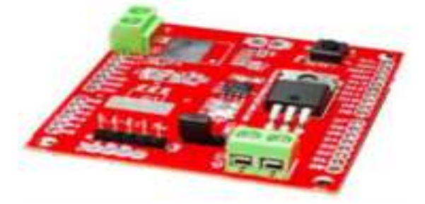
Fig.8. Li-Fi transmitter

The LED used in the system has a 12V input voltage and have its luminous flux to be 600 lumen, which is standard for a headlight in a vehicle.