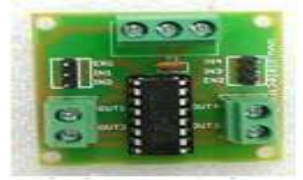
Fig 7: Motor Driver

and enable pin 1 as high. The other one is controlled using logic pins 10 & 15 and enable pin 9 as high. Thus, enable pin is needed to make the drivers work. If enable input is low, the output take high impedance state and motors receive no signal.