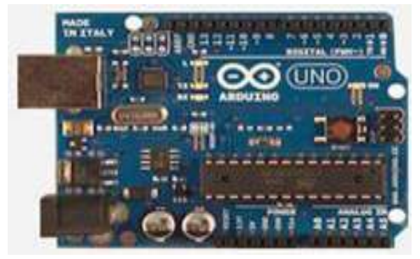
Fig 5: Arduino Board

preceding boards in this it doesn't use the FTDI USBto serial driver chip. Instead, it uses the Atmega16U (Atmega8U2 up to version R2) programmed as a USB-to-serial device.