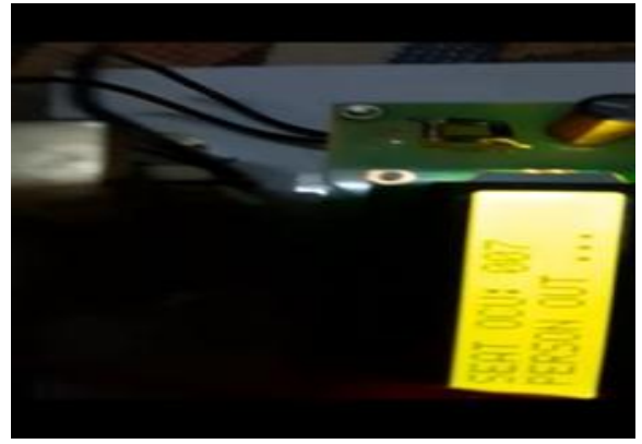
Fig. 10 LCD display of persons OUT

Fig 10 and Fig 11 shows the count of persons which is received by the sensor detection if any human interruption seems to occur. Fig 10 shows the count of seat occupied and fig 11 shows the count when the person leaves the hall.