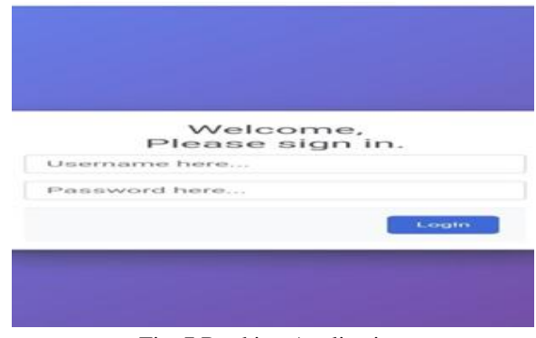
Fig. 7 Booking Application

In this section, the logic is already stored in the microcontroller to act accordingly. Using this we are able to see the particular date and time according to the seats filled. The updating of required time can be done by booking it. The sensors which are placed parallel at the two ends of a door detect the object and increase or decrease the count accordingly.