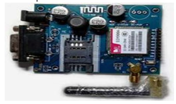
Fig 3 GSM module

GSM modem sends the total consumption to the consumer via SMS. GSM stands for Global System for Mobile Communication. A GSM modem can be used to make a computer or any other processor communicate over a network. A GSM module needs a SIM card to send messages to the consumer. It operates over a network range subscribed by the network operator.