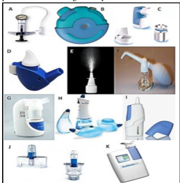
Fig. 3. Nasal delivery devices: Insufflators (A), Dry powder inhaler (B), Pressurized Metered-Dose Inhaler (C), Breath-powered Bi-Directional technology (D), Sprays and Solution (E), Instillation and rhinyle catheter (F), Compressed air nebulizers (G), Squeezed bottle (H), Metered-dose pump sprays (I), Single and duo dose spray devices (J), ViaNase atomizer (K)

is likely to occur, and some concerns related to airway irritation and reduction in pulmonary function have been raised in relation to long-term exposure to inhaled insulin when Exubera was marketed for a short period as a treatment for diabetes. This example highlights the issue of unintended lung delivery, one important potential clinical problem associated with using nebulizers and atomizers producing respirable particles for nasal drug delivery.