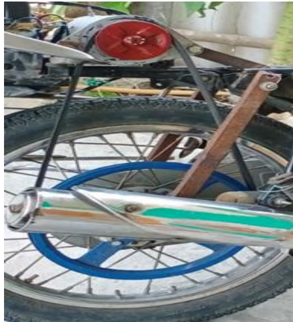
Fig: V belt drive

Belt drive:- The V-belt acts as a transmission belt. Connecting the V-belt pulleys, it transmits the force from the engine to the ancillary components including the alternator.