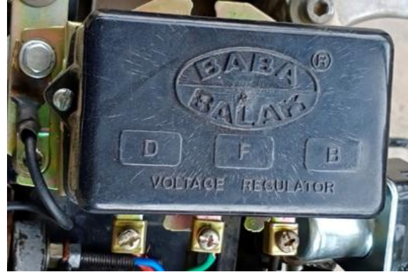
Fig: voltage regulator

Voltage regulator:- As the name implies it keeps the voltage at an appropriate voltage so that the battery stays fully charged and last as long possible. If the voltage is too high the battery will outgas and loose water. Also battery life can be reduced. Also hydrogen gas can be generated which could cause an explosion. If the voltage is too low the battery will not fully charge and may not start the vehicle. Also again the battery life can be reduced.