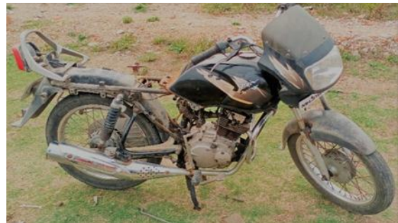
Fig: bike chassis

Bike:- the main motive of our project is to provide secondary running source to the any two wheeler. In our project we choose the victor bike, but the setup can be attached to the any two wheeler.