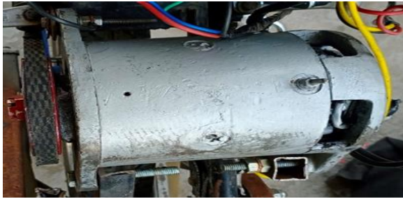
Fig: Alternator DC motor

Alternator DC motor:- It is a multifunctional motor which produce energy Also it drives the wheel when we provide the power to the motor. It start producing energy when it will rotate about 2000 rpm or above. The starting speed of the motor has low and gets fast as per running more. When it will rotate about 2000rpm or above it will produce electric energy about 8-9 volt and this electric energy is stored in battery. Using this energy we will run the motor as result it will drive the wheel.