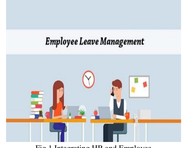
Fig.1 Integrating HR and Employee

When there is a big organization having pool of employees working, the HR manager should concentrate on the employees convenient inside organization. Here, the employees informed their leave using formal text messages (i.e. WhatsApp). This format of applying leave will be difficult to HR while calculating Payroll for leave management.