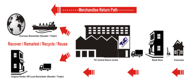
Figure 1. Reverse logistics processes

http://www.inboundlogistics.com/cms/article/closing-the-supply-chain-loop-reverse-logistics-and-the-scormodel/