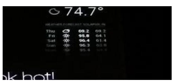
Fig -7: Output of smart mirror