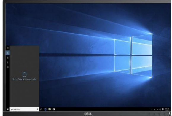
Fig -4: LED Display

A LED showcase is a level board show, which utilizes a variety of light-transmitting diodes as pixels for a video show.