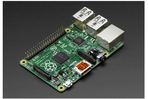
Fig -3: raspberry pi 3

SD port for stacking your working framework and putting away information Upgraded exchanged Micro USB control source up to 2.5A.The Raspberry Pi 3 is a MasterCard measured PC fit for doing pretty much anything a work area PC does.