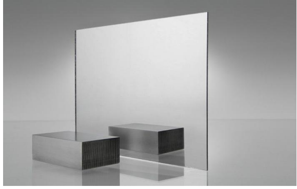
Fig -5: Acrylic Mirror

Acrylic Mirror is a lightweight, reflective thermoplastic sheet material used to improve the look and security of showcases, POP, signage, and an assortment of created parts. Acrylics reflect is perfect for retail, sustenance, promoting, and security applications. A sturdy vacuum metalizing process makes acrylic reflect sheet for all intents and purposes scratch-safe amid manufacture procedures and end use. Perfect for use where glass is excessively overwhelming or may effectively split or break, plastic mirror is a solid option in contrast to customary mirrors.