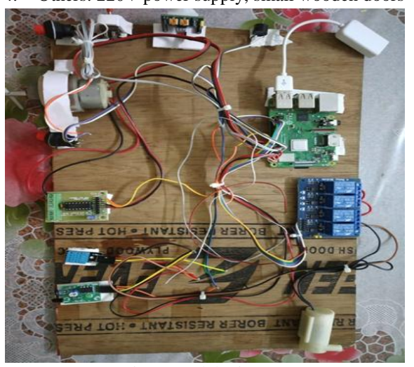
Fig.2. Model Diagram