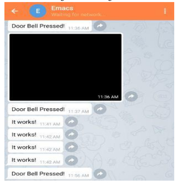
Fig. 3. Page in Telegram