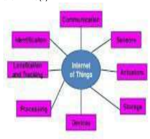
Fig 2. IoT

There are several protocols are used communications. In the IoT concept communication among the things are very important. Data are gathered and sent to a remote server then informed or indicating device content or the environment around it. Suppose if information is required sent back to devices with other information to motivate and taking various decisions. For this reason, communication protocols are used. Message Queue Telemetry Transport (MOT) This type of protocol employs on top of TCP. It is giving a reliable stream of data, it can be controlled with it. Extensible messaging and presence protocol (XMPP) this type of protocol is used for connecting devices to people. Instead of D2S protocol XMPP is used mainly it uses for consumer oriented IoT applications. Data distribution service is an end to end type of protocol. It connects device to device for communication. It performs over network that can be chosen which information goes where exactly. Advanced message queuing protocol uses several server based functions. It can provides a link to web users. Other protocols are REST, API, IPV6 and MIPV6.[5]