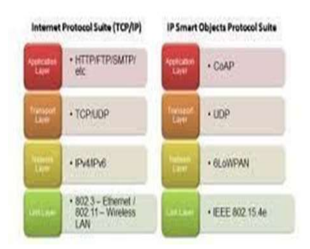
Fig 3. TCP/IP STACK and IP Smart Objects Protocols Stack