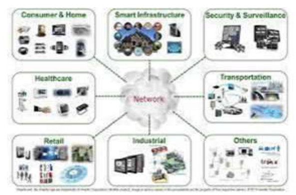
Fig 6. IoT Applications