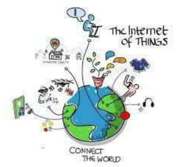
Fig 1. IoT World

We do believe that this fragmentation is potentially harmful for the development and successful adoption of IoT technologies. We therefore hope this survey can help in bridging existing communities, fostering cross- collaborations and ensuring that IoT-related challenges are tackled within a system-level perspective, ensuring that the research activities can then be turned into successful innovation and industry exploitation.