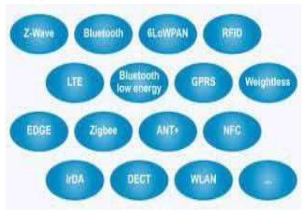
Fig 7. Different technologies

architecture can be used in this concept. As SOA approach applications are running on static computers, it requires adaptive to various context. Normally SOA can be deployed on three layers. Each layer participating for different functionalities in the IoT [3].