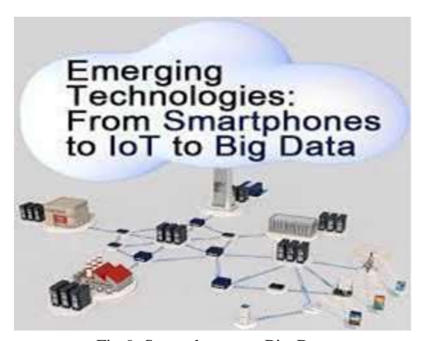
Fig 9. Smartphones to Big Data