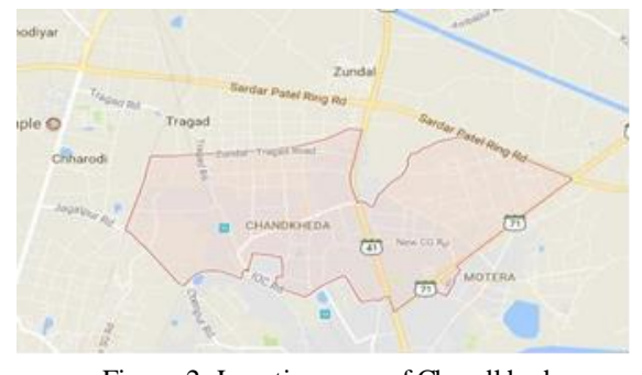
Figure 2: Location map of Chandkheda

In addition the study of this research is limited to selecting only two neighborhood area. These two neighborhoods are compared and verified with the indicators of the sustainable transportation system. These two neighborhoods are Chandkheda and Kathwada, which are located at the edge of the city of Ahmedabad.