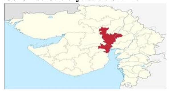
Figure 1: Location map of Ahmedabad

The city of Ahmedabad is located in the state of Gujarat, which is located in the western part of India. The city of Ahmedabad is the seventh largest metropolis in India and the largest in the state. The city is known as the commercial capital of the state and known as the textile capital of India. The city of Ahmedabad is governed by Ahmedabad Municipal Corporation (AMC), the area of approximately 466.35 km² and Greater Ahmedabad is under the jurisdiction of the Ahmedabad Urban Development Authority (AUDA) with an area of approximately 4200 sq km. The lattitude of ahmedabad city is 23.0225° N and the longitude is 72.5714° E.