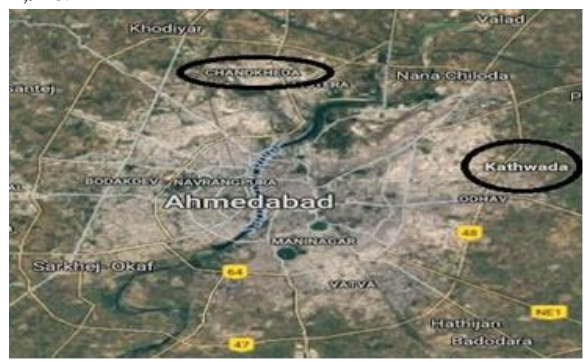
Figure 4: location map of neighbourhood

The population of Kathwada is 23,300 and contains the area of 7.25 sq. km. The density of Kathwada area is 3,217/km sq. It contains the household of 4,940.