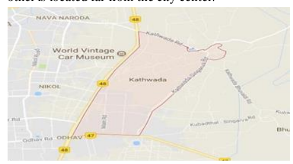
Fig 3: Location map of Kathwada

Both the areas have similar characteristics, in terms of socio-economic characteristics. Both the areas are of similar size and well-developed neighborhoods. As one is old developed and other is newly developed area. Also one is located near the city center and the other is located far from the city center.