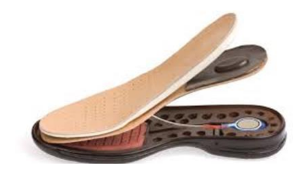
B.MEASURING METHOD OF LINK INCLINATION USING ACCELEROMETER

To the motion control of an active type walking support system, one of the vital goals of the manageability is the effective detection of the user's walking intentions. Also, the design of the humanrobot interface should realize the easy and smooth operating experience. By detecting the user's intentions though physical interaction, the force sensor interface offers a naturally and intuitively way to reach that goal. Compared with other force sensor devices like joysticks or levers, the flexible type device is better in this case because this type of device is familiar to the elderly and their preconceived notion. Another problem should be taken into consideration is the stability of the humanrobot interface of an active type walker. In our design the force sensors embedded in two feet offers a nature negative feedback loop of the motion control. By such a way, this interface guarantees a stable realization of the motion control.