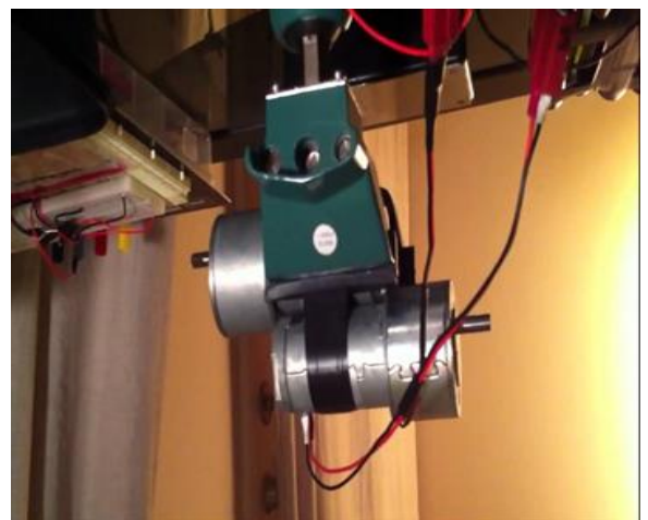
Fig.3 Gear Motor

The L298IC driver module, using ST's L298IC chip can directly drive two 3-30V DC motor, and provides a 5V output interface can 5V single-chip circuitry to supply, support 3.3VMCU control, you can easily control the DC motor speed and direction. To control the motor we need a motor driver as the current drawn by the motor is large to be provided from the microcontroller. Thus a motor driver IC L298N is mounted on the shield. This IC can control two motors. An H- Bridge setup is needed to provide the sufficient power to the motor. The driver controls the motors through this H Bridge. The motors could be connected to the shield through the screw terminals which are named as MOTOR A and MOTOR B. The screw terminals in between these two motors are the dedicated power source to the motor. The MOTOR A is connected to Pin 6 and 5. The MOTOR B is connected to 10 and 11