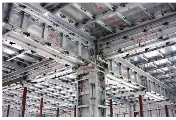
Fig 2: Mivan frame work