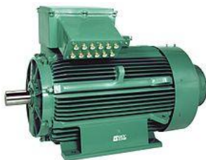
Fig 1.1 Ac motor

An AC motor is an electric motor driven by an alternating current (AC). The AC motor commonly consists of two basic parts, an outside stationary stator having coils supplied with alternating current to produce a rotating magnetic field, and an inside rotor attached to the output shaft producing a second rotating magnetic field. The rotor magnetic field may be produced by permanent magnets, reluctance saliency, or DC or AC electrical windings