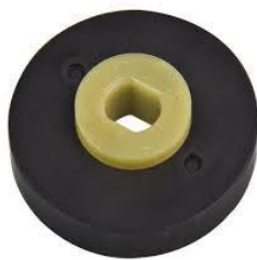
Fig 1.3 Injection Moulded Magnets

Injection-molded magnets are a composite of various types of resin and magnetic powders, allowing parts of complex shapes to be manufactured by injection molding. The physical and magnetic properties of the product depend on the raw materials, but are generally lower in magnetic strength and resemble plastics in their physical properties.