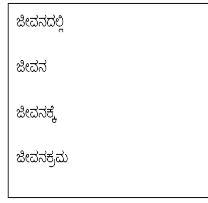
Figure2: The sample input

The sample data set containing Kannada words is taken as shown in Figure2. The output we got when we apply the proposed algorithm is as shown in the figure3.