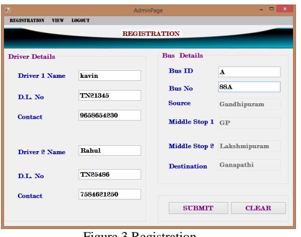
Figure 3 Registration